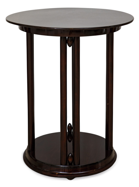
TABLE MODEL "FLEDERMAUS"JOSEF HOFFMANN THONET CA.1912