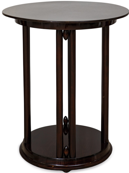
TABLE MODEL "FLEDERMAUS" JOSEF HOFFMANN THONET CA. 1912